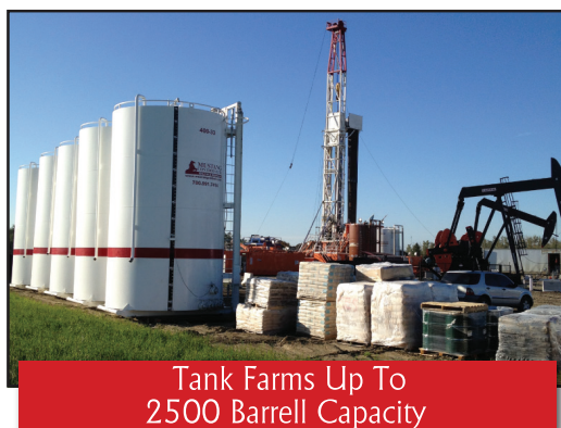
Tank Farms Up To 2500 Barrell Capacity