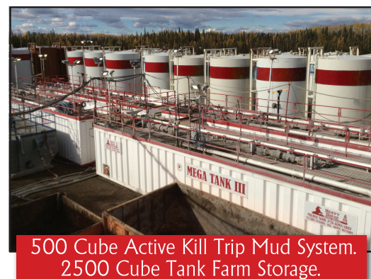
500 Cube Active Kill Trip Mud System. 2500 Cube Tank Farm Storage.