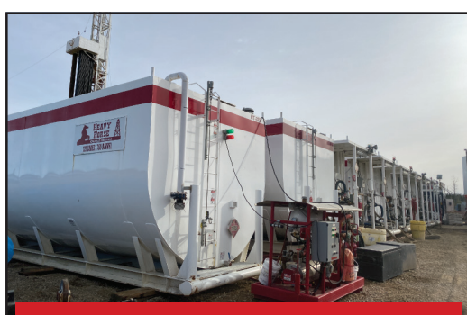
300K BTU Heating 400m3