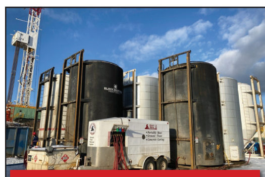
400K BTU Diesel Units